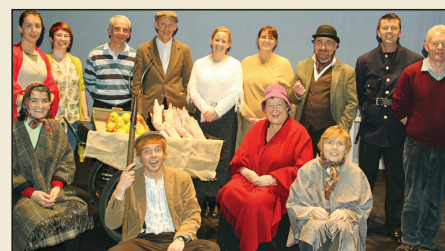
Aisteoirí an Lóchrainn

AISTEOIRÍ agus lucht bainistíochta an fhoireann drámaíochta agus iad an-sásta