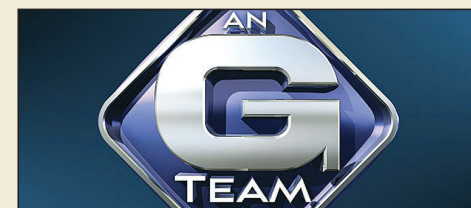
An G-Team ar TG4

Tiocfaidh na ceamaraí chuig an mbaile ar 'G-Day' le féachaint ar an bpobal agus